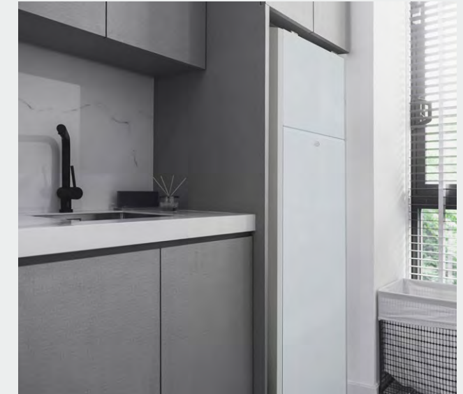
Grant integrated 210ltr cylinder