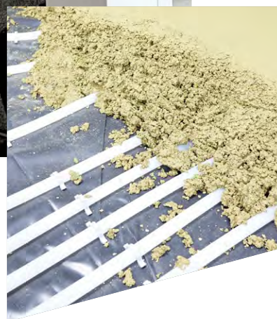
Grant Uflex Underfloor heating

A room's look is an important consideration for homeowners and today's market offers a range of options, broadening the horizons beyond traditional radiators.