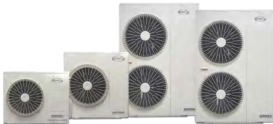
Grant AERONA 3 R32 air to water air source heat pump, 6kW, 10kW, 13kW & 17kW

Once heat loss calculations are finalised and the heat load for each room within the property is known, correctly sized heating products are specified for your property.