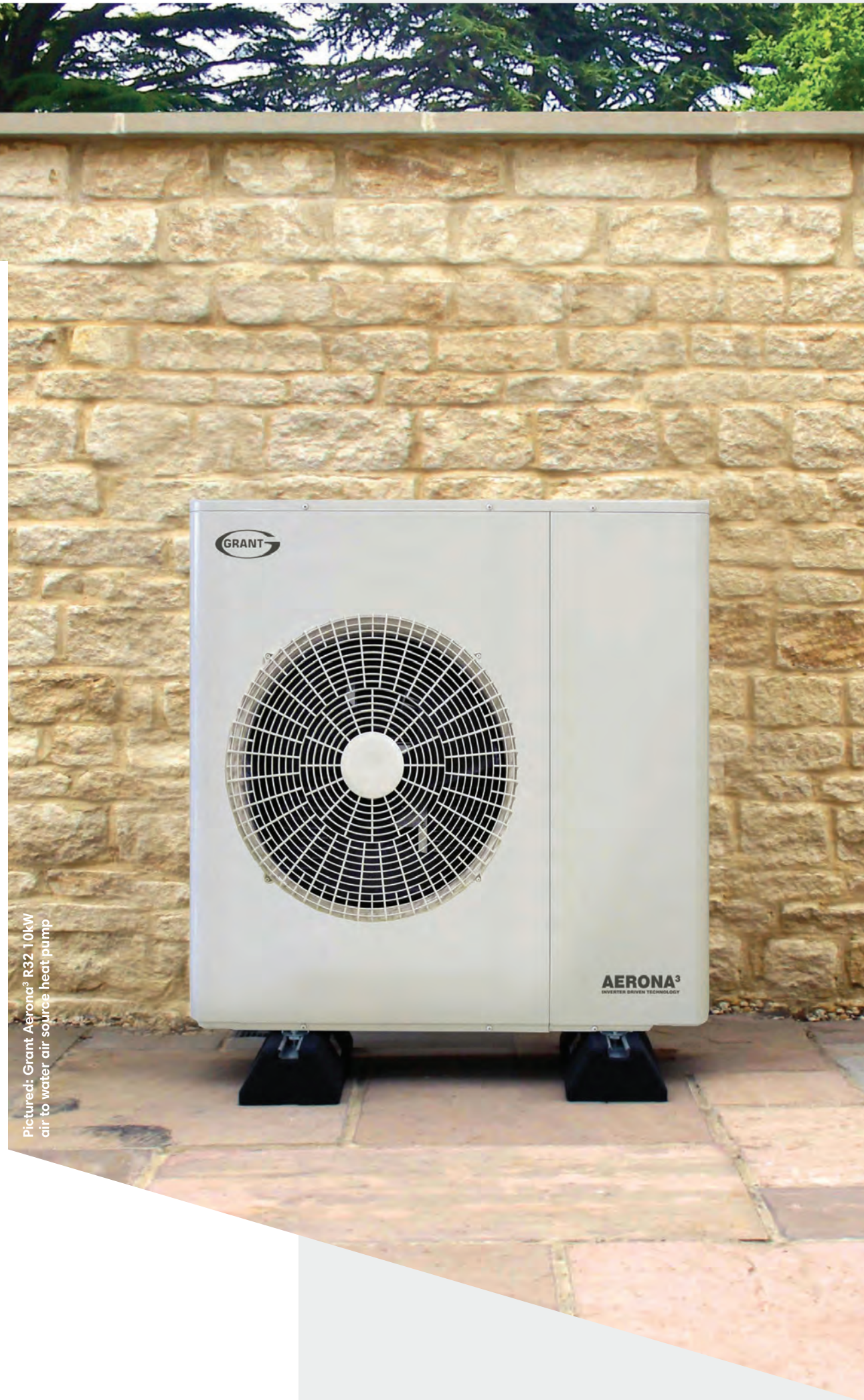
Pictured: Grant AERONA 3 R32 10kW air to water air source heat pump