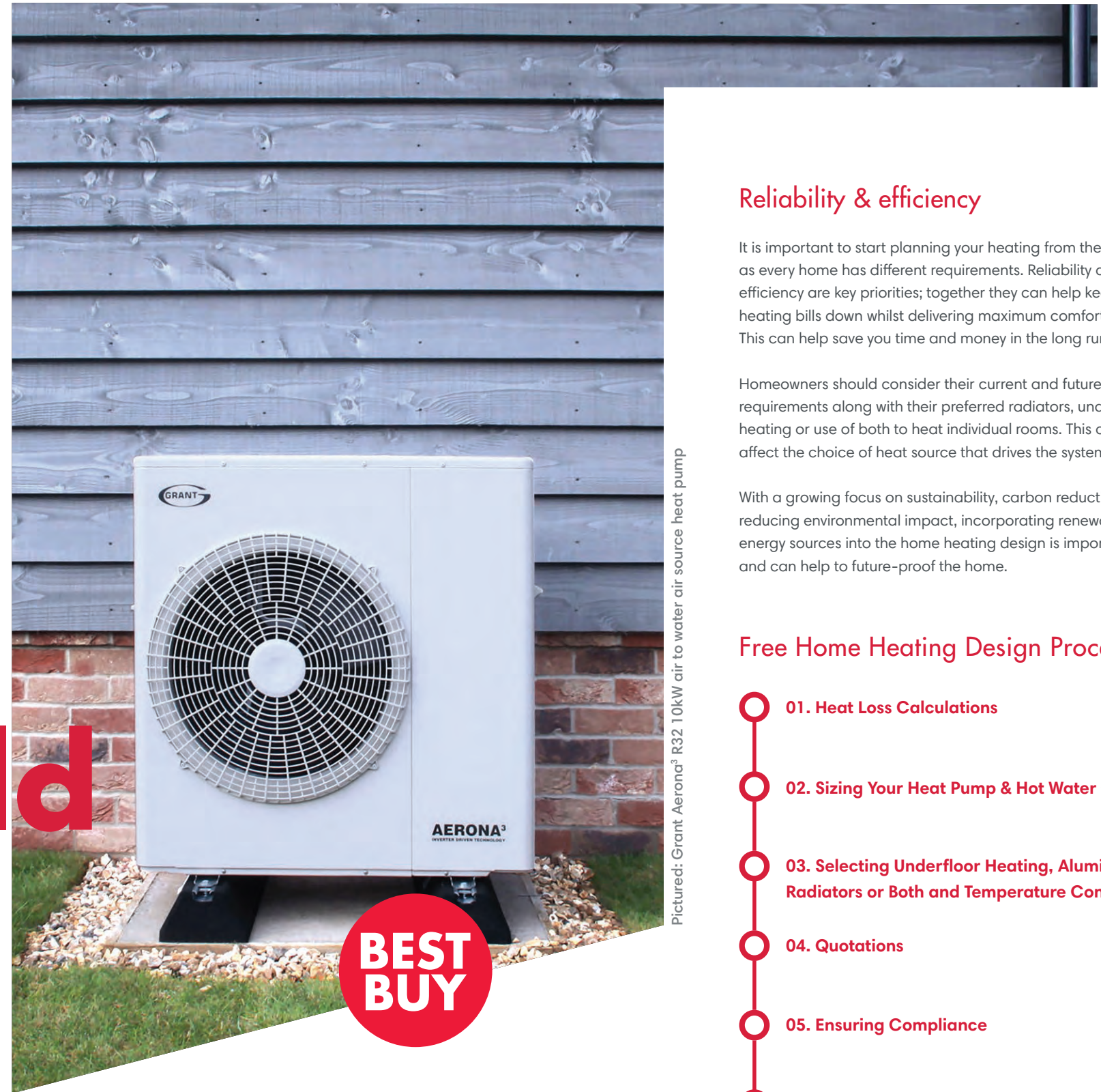
Pictured: Grant AERONA 3 R32 10kW air to water air source heat pump

We also recognise that selecting the right system can be a daunting process. We have developed this guide to help you on your journey by outlining the specific products you need to heat your new build home.